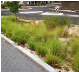
BIRCH CRESCENT WATER SENSITIVE URBAN DESIGN