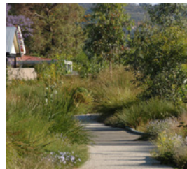
VERGE AND RAIL CORRIDOR BUFFER PLANTING WITH NATIVE SPECIES