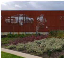
INTEGRATED PUBLIC ART OPPORTUNITIES ALONG GREENWAY, AT STATION AND POCKET PARK