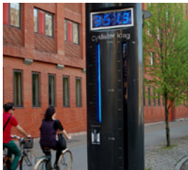
SIGNAGE + WAYFINDING / TECHNOLOGY