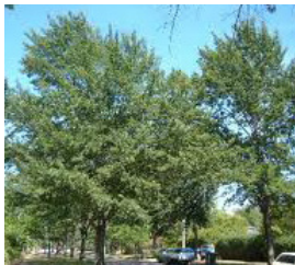
NEW STREET TREES AND PLANTING ADJACENT SHARED USE PATH