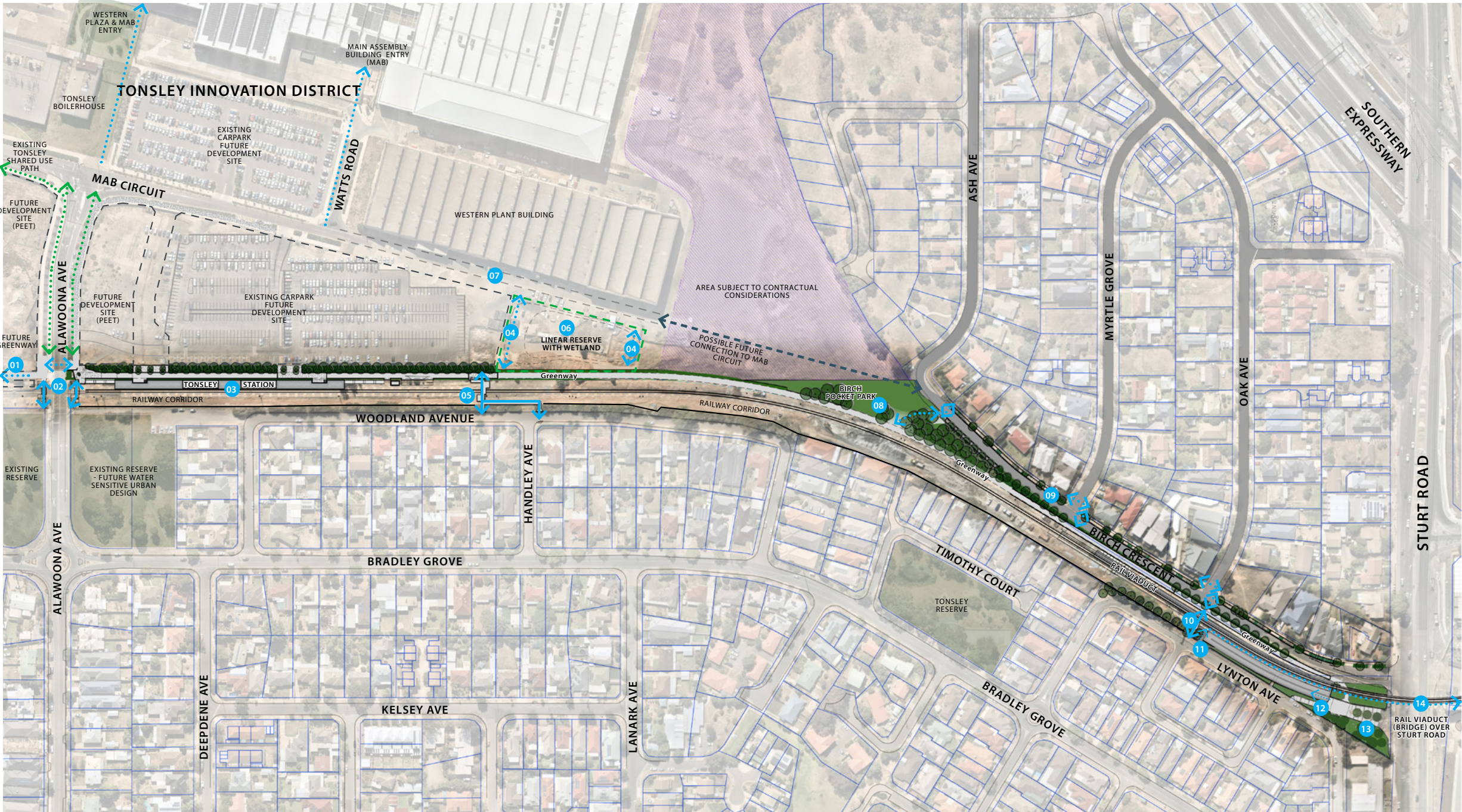
Plan is indicative.