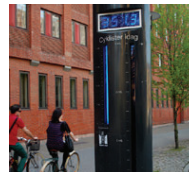
SIGNAGE + WAYFINDING / TECHNOLOGY