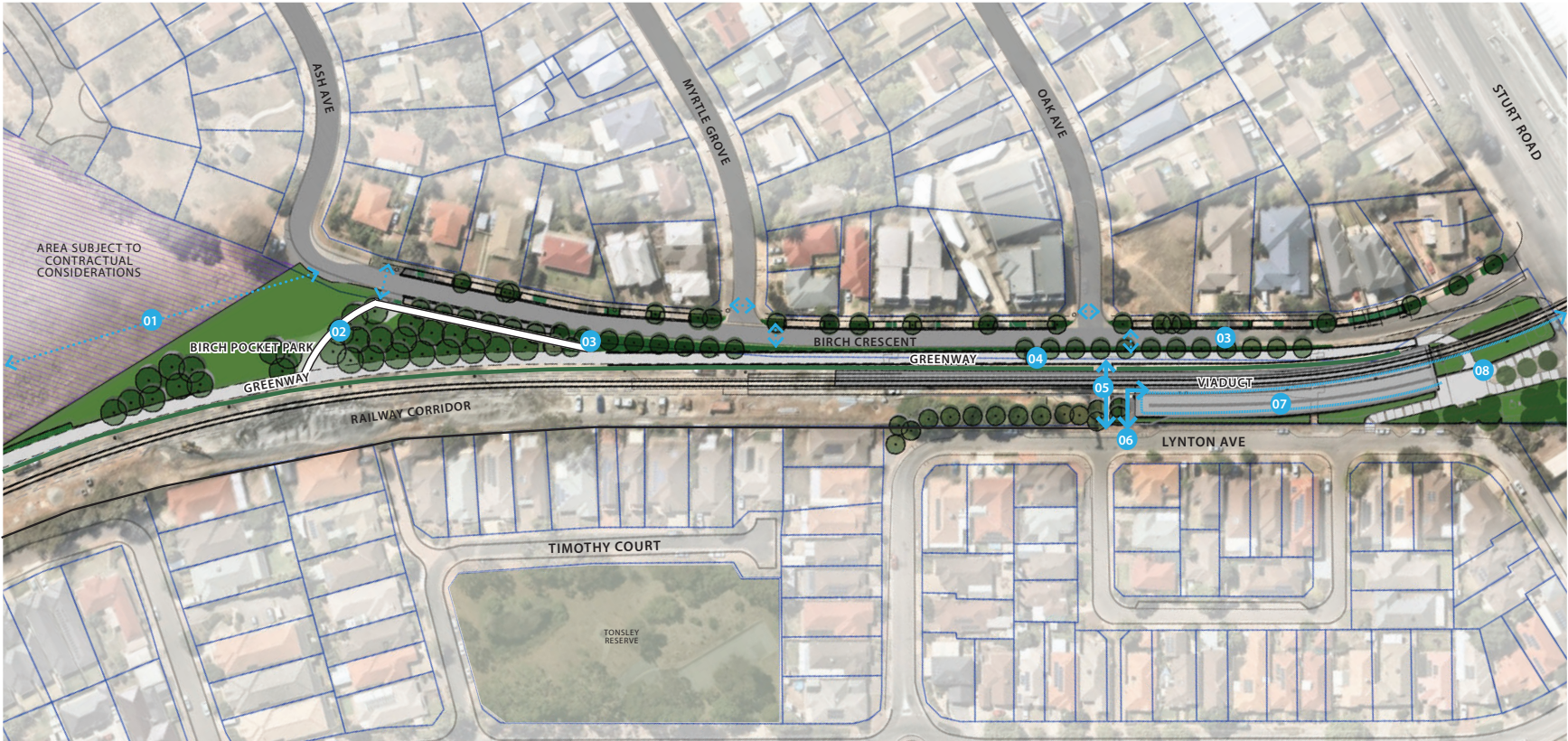
Plan is indicative.