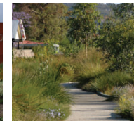
VERGE AND RAIL CORRIDOR BUFFER PLANTING WITH NATIVE SPECIES