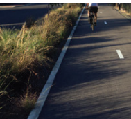
3M WIDE BITUMEN SEALED SHARED USE PATH