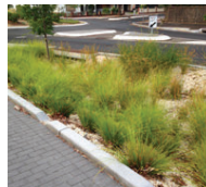
BIRCH CRESCENT WATER SENSITIVE URBAN DESIGN