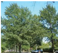
NEW STREET TREES AND PLANTING ADJACENT SHARED USE PATH